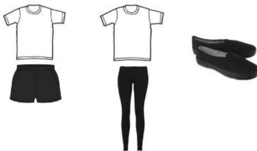
PE Kit Reminder!

Black jogging bottoms or shorts, a white t-shirt and trainers or plimsolls.